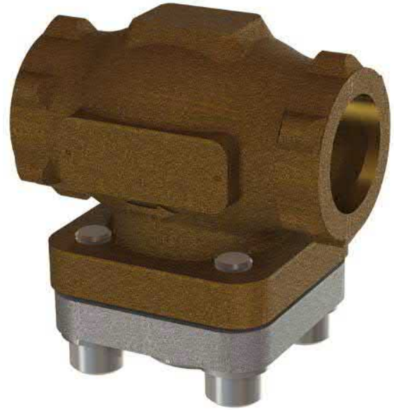
DN25 Bronze Strainer with Socket Weld Ends

All valves are degreased for oxygen duty, assembled in clean room conditions and pressure tested prior to dispatch.