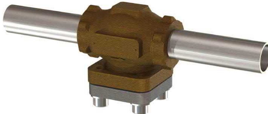
DN25 Bronze Strainer with Stainless Steel Stubs

CE Marked according to the Pressure Equipment Directive.